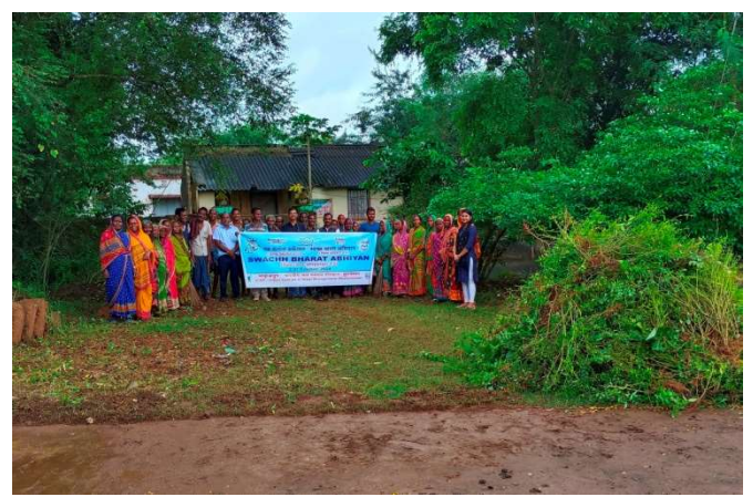
'Before and After' photographs of the swachhata drive in front of Jamujhari Forest Office